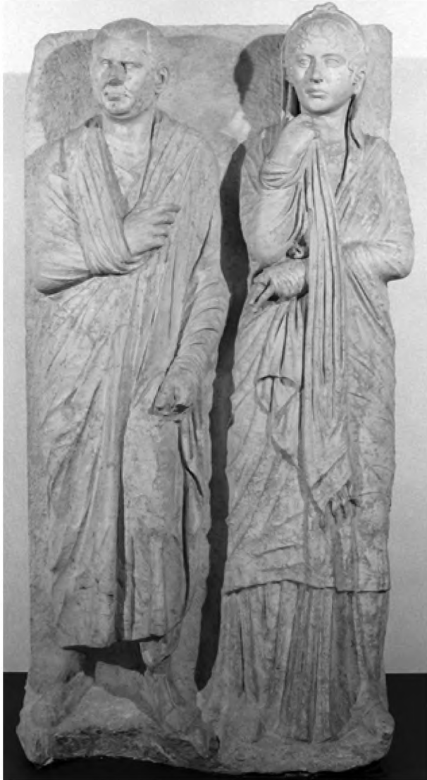
Fig. 3: Full-figure relief from the Via Statilia, Rome, with the man wearing a toga (?) draped with an arm sling and a woman in the Pudicitia pose. Capitoline Museums/Centrale Montemartini, inv. 2142, 75-50 BC.

Apart from these gestures, however, the arrangement of the arms and hands on both sets of monuments should be seen not so much as gestures with quite specific meanings as characteristic forms of body language with more generalised, and, indeed often multiple, connotations. I shall examine this concept in more detail in relation to two of the most com-