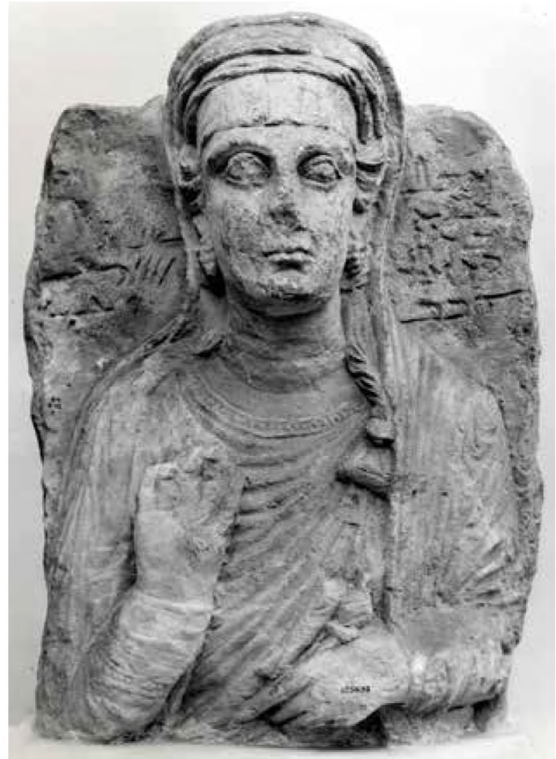
Fig. 2: Limestone relief from Palmyra with bust of a woman with raised right hand, palm facing the viewer, carrying a spindle and distaff in her left hand, named as Ala daughter of Iarhai in the inscription, British Museum, ME 125695, dated AD 113-4.

hand clasp, used to unite male and female figures on the Roman reliefs also belongs in this category of meaningful gesture, as it seems to be a sign used to show that the two people in question identified themselves as a legitimately married couple. Both gestures would appear to be culture-specific: the palm-out gesture is not used on the Roman reliefs, or the dextrarum iunctio on the Palmyrene reliefs.