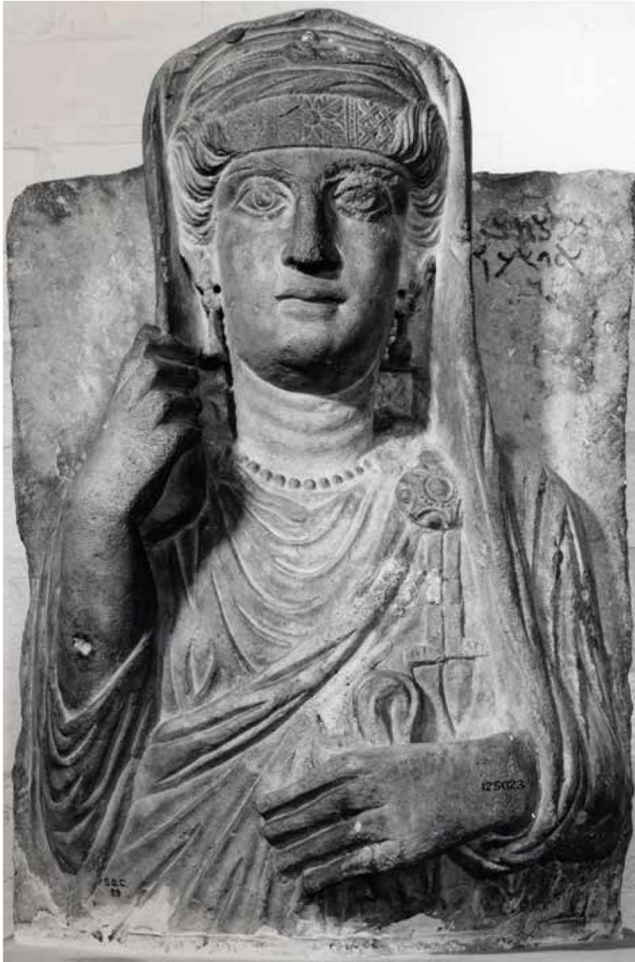
Fig. 6: Limestone relief from Palmyra with bust of a woman with her right arm raised to hold her veil, named in the inscription as Malkat daughter of Aid'an, British Museum, ME 125023, AD 150-200.

in the early Roman Empire has been called Pudicitia for a long time. 23 The pose of this type is characterised