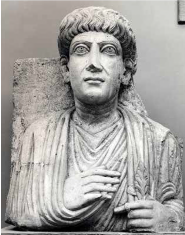
Fig. 1: Limestone relief from Palmyra with bust of an unknown man carrying a leaf, in the British Museum, ME 125022, AD 150-200. (© Trustees of the British Museum).

Some of the hand postures used on both the Palmyrene and the Roman reliefs could reasonably be interpreted as gestures with a specific meaning: this applies for example to the gesture of the hand held raised and open with the palm facing the viewer (see fig. 2) 5 on Palmyrene reliefs, which Heyn identifies as a gesture of worship. 6 The dextrarum iunctio , or right