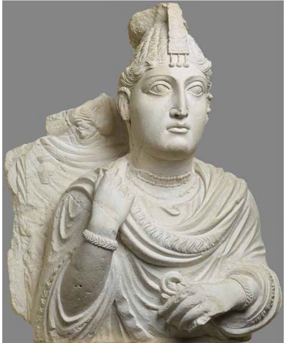
Fig. 8: Limestone relief from Palmyra with the bust of an unknown young woman with her right hand raised to her neck. British Museum, ME 125016, AD 150-200.

has been interpreted as an allusion to mourning, 31 or it may rest near the neck or collarbone (see fig. 8, where