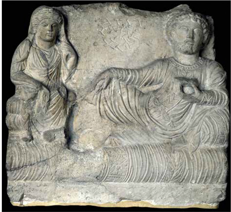
Fig. 10: Limestone relief from Palmyra with a 'funerary banquet' scene, British Museum ME 132614, AD 200-273.

iunctio , although this is not common on the half-figures reliefs, and, as at Palmyra, parents sometimes put their arms round their children. 46